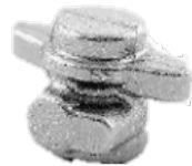
Injection body pump