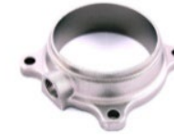
Exhaust system flanges