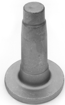
Rear axle shaft