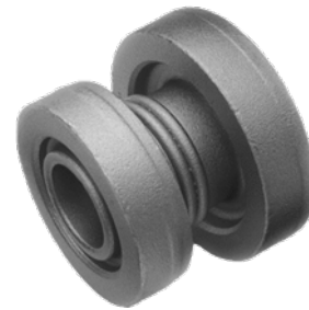
Countershaft with friction welding